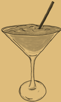
Rosé Vodka - 14. 95 -