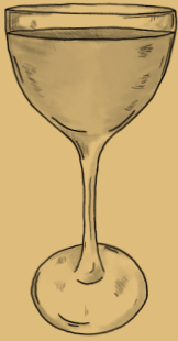
Kikusui Junmai Gingo - 12. 50 -