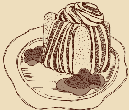
Strawberries & Cream † - 14.99 strawberry, vanilla whipped cream, meringues