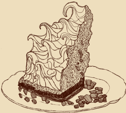
Butterfinger Pie † - 14.99 milk chocolate custard, graham crackers, soft meringue