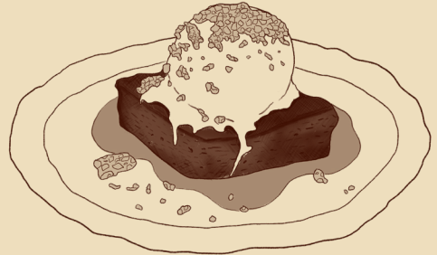
Sticky Date Cake - 16. 99 date crumble, brown butter ice cream, toffee sauce