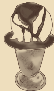
Ice Cream & Sorbet ® - 9. 99 vanilla, chocolate, brown butter, bananas foster, salted caramel ice cream & strawberry sorbet add goldbrick - 3. 00

® can be made with gluten free ingredients † contains nuts