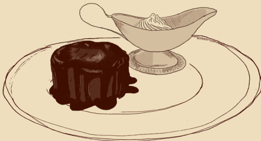
Flourless Molten Chocolate Cake ® - 15. 99 hot fudge, vanilla whipped cream